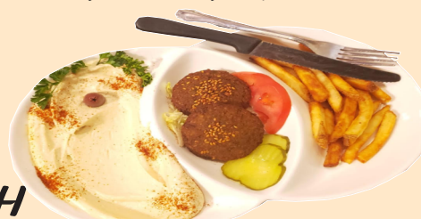
FALAFEL AND HOMMOUS