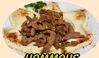
HOMMOUS WITH LAMB